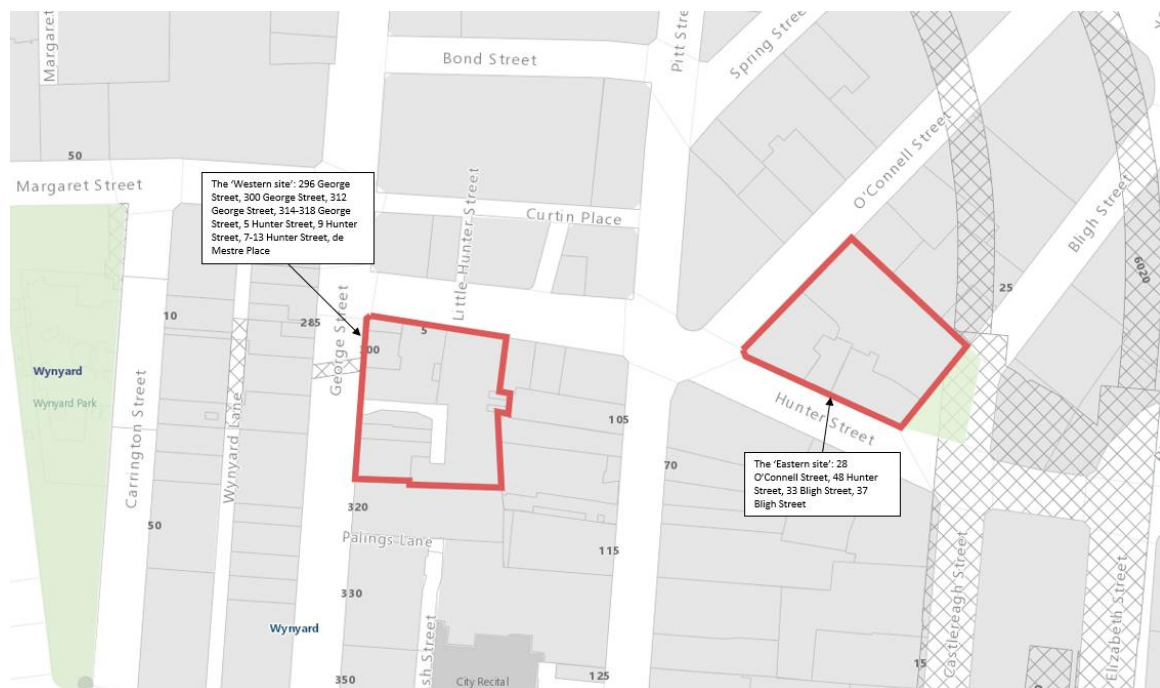
Figure 2: Diagram of location of the two sites and surrounding area