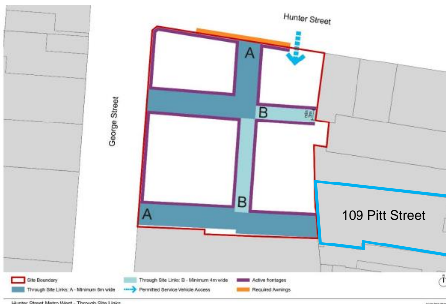
Figure 3: Western site layout - through site-links, retail activation and access

Figure 6: The site layout figure for the Western Site as shown in the Design Guidelines, detailing the identified connection to the 109 Pitt Street, shown in blue