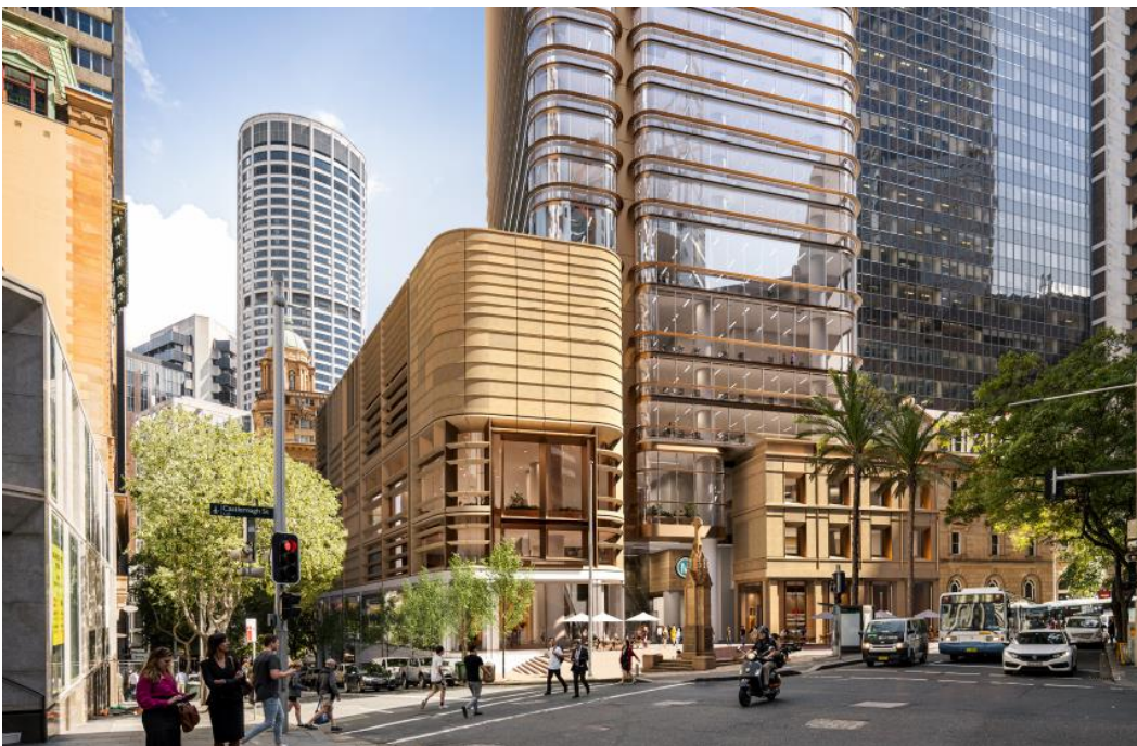
Figure 4: The podium and tower of the proponent's indicative reference scheme of the eastern site and larger Richard Johnson Square