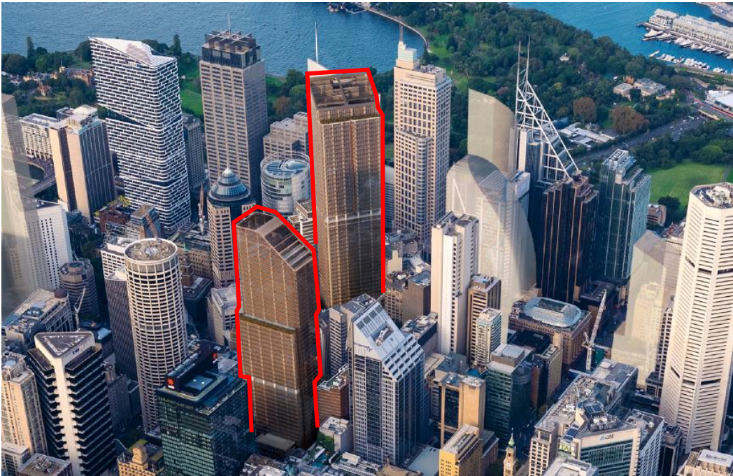
Figure 3: Proponent's reference scheme of the two over-station development towers, outlined in red